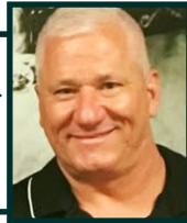
Joseph Montalbano Senior Deputy Commissioner Suffolk County Department of Labor, Licensing and Consumer Affairs